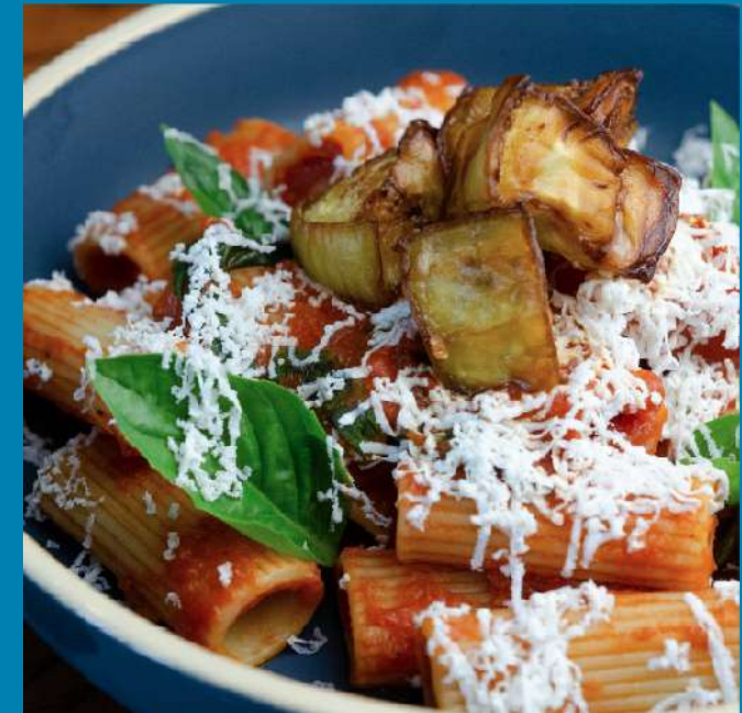
Rigatoni alla Norma 290