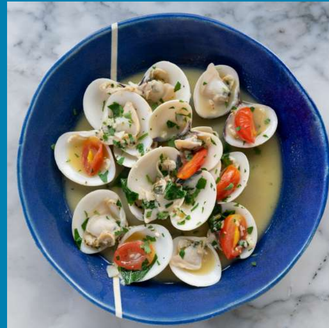
Clams sautéed in white wine & garlic sauce 290