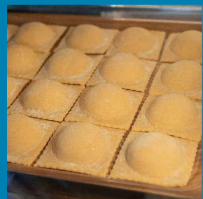
Burrata Ravioli (fresh pasta - 5 pcs) 340

* Price is subject to govt. tax * Delivery fee is excluded