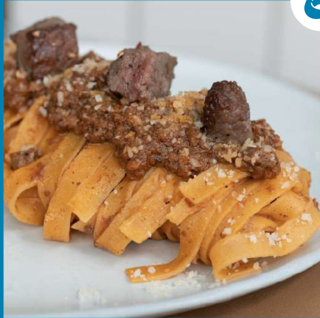
Tagliatelle Wagyu Bolognese 690