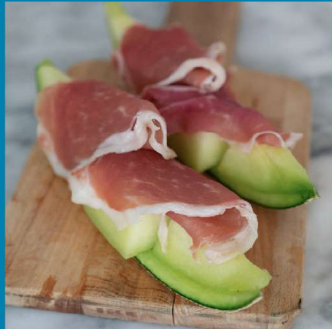
22-months aged Parma ham & winter melon 420