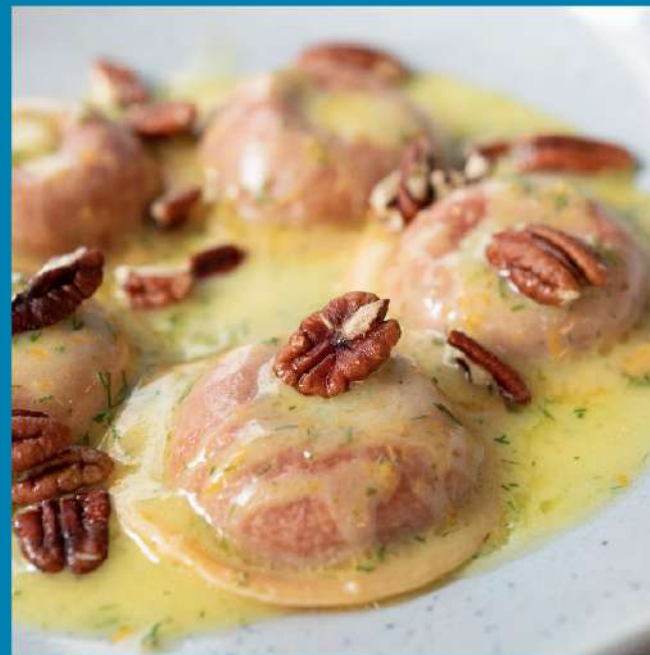
Fresh duck's egg Ravioli & black truffle 390 Add Italian black truffle 1 gram (140)