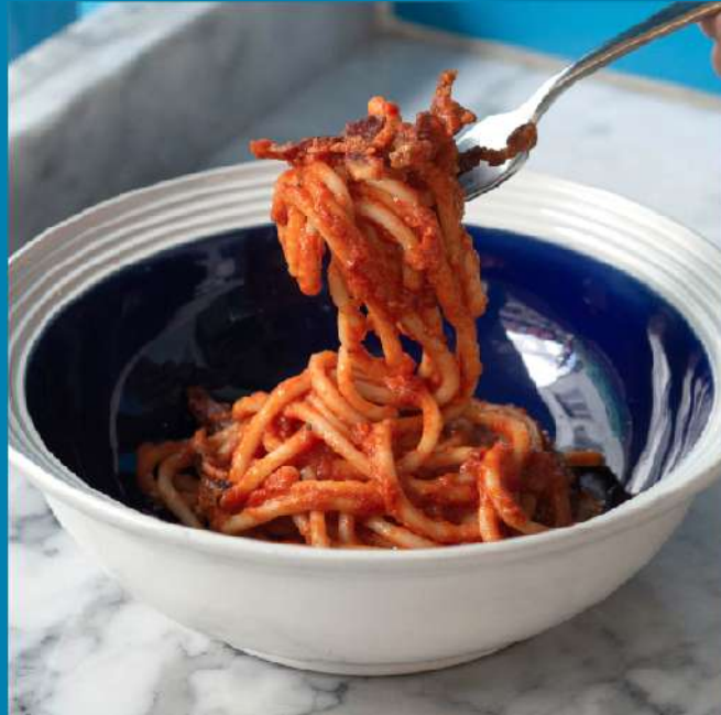
Amatriciana (Bucatini or Rigatoni) 390