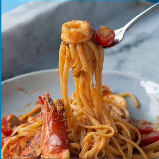
Spaghetti 'allo Scoglio' 690