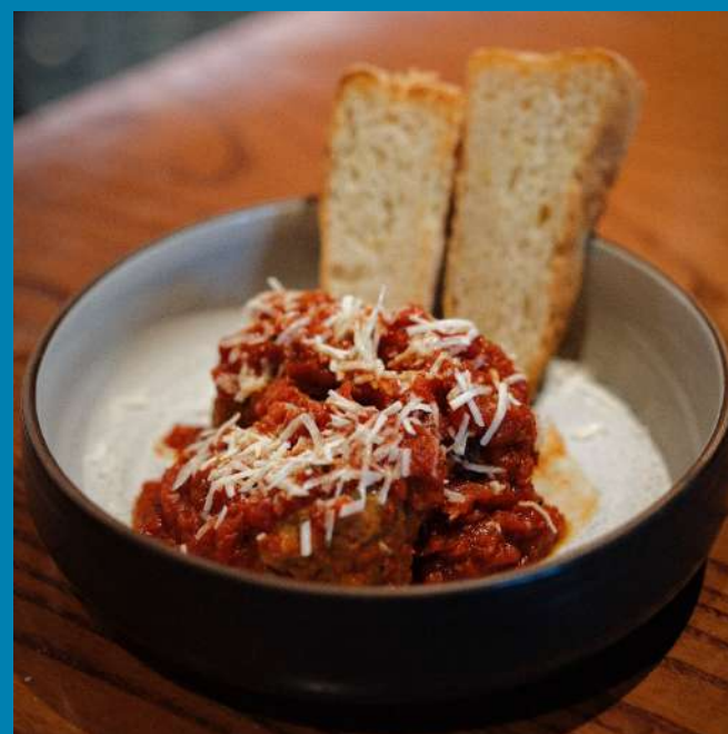
Lamb meatballs New Zealand lamb shoulder, lightly spicy tomatoes sauce & Pecorino Romano DOP 370

* Price is subject to govt. tax * Delivery fee is excluded * Please allow our service team to reconfirm your order as some items might not be available