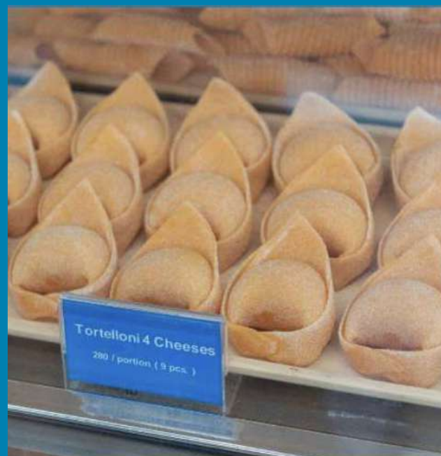
Tortelloni 4 cheeses (fresh pasta - 9 pcs) 340