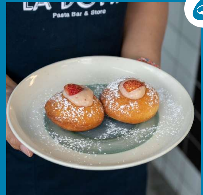
Bomboloni Strawberry & Champagne 1 pc 140

* Price is subject to govt. tax * Delivery fee is excluded * Please allow our service team to reconfirm your order as some items might not be available