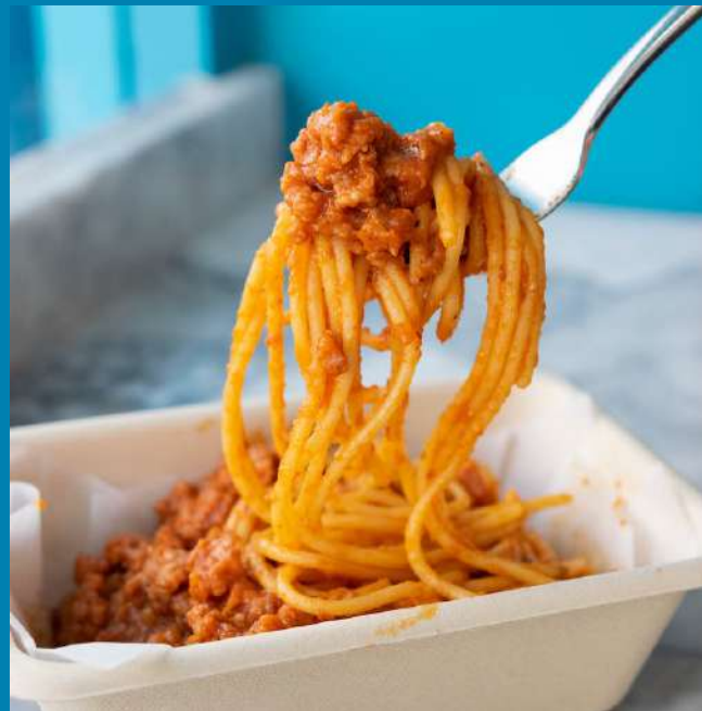
Spaghetti with pork sausage 290