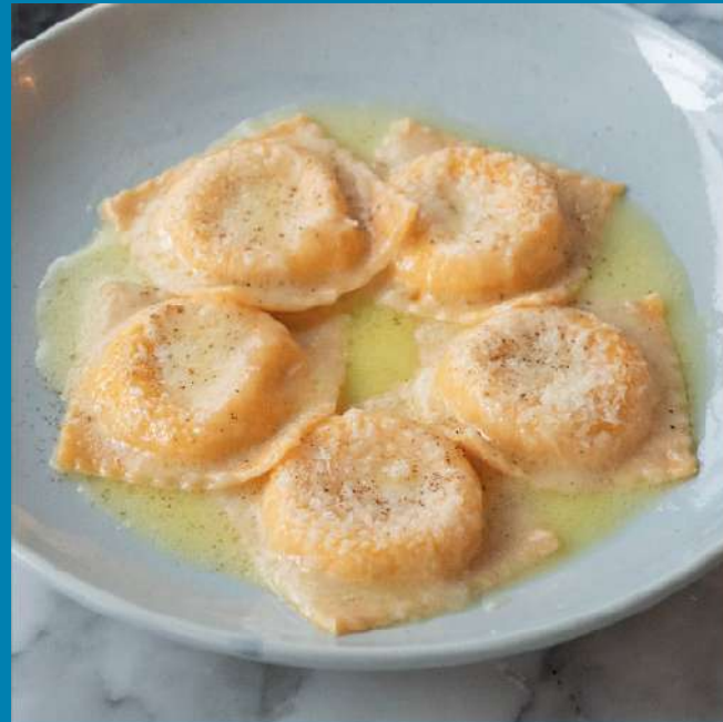
Burrata Ravioli 490 Add Italian black truffle 1 gram (140)