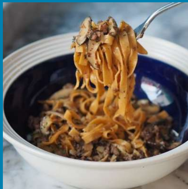
Tagliatelle alla Montanara 390