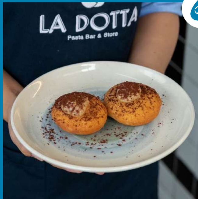
Bomboloni Tiramisu 1 pc 140