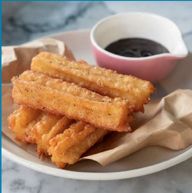
Churros with Couverture chocolate 240