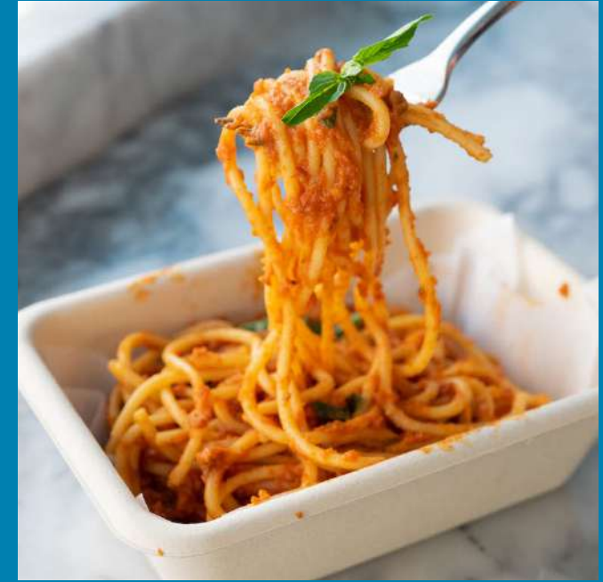
Spaghetti with tomatoes sauce 290