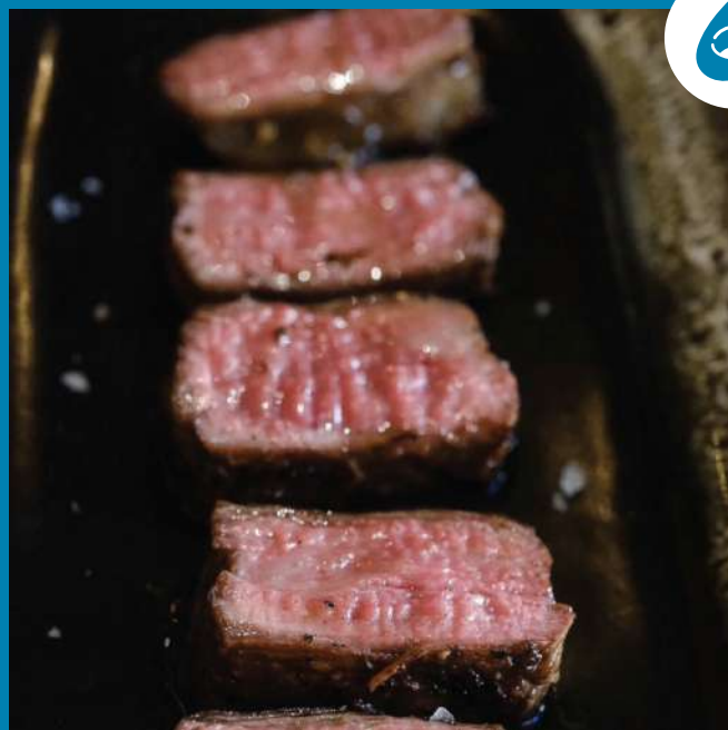
Australian Wagyu flank beef 'Tagliata' 590