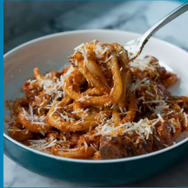
Pici pork ribs 520