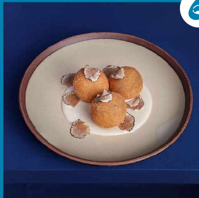
Truffle, sage & Ricotta deep fried balls 320