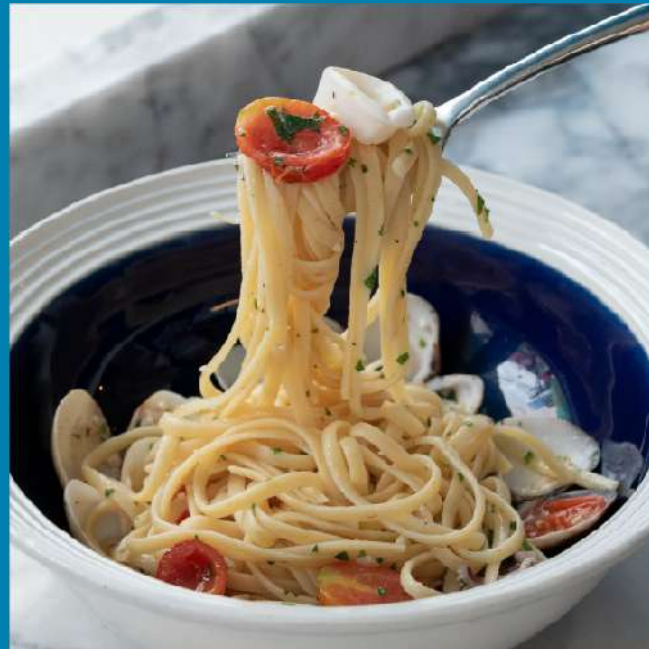
Vongole e Moscardini (Linguine or Paccheri) 390