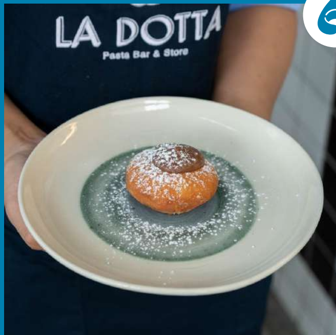
Bomboloni Nutella 1 pc 140