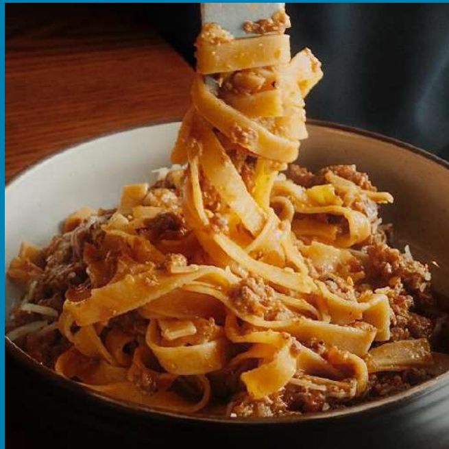
Tagliatelle duck ragù 390