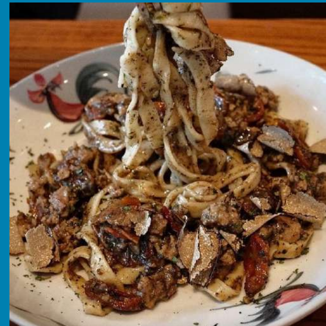
Stringozzi with pork ragù & black truffle 590 Add Italian black truffle 1 gram (140)

* Price is subject to govt. tax * Delivery fee is excluded