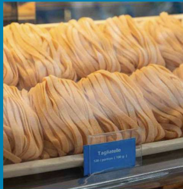
Tagliatelle (fresh pasta - 100 g) 140