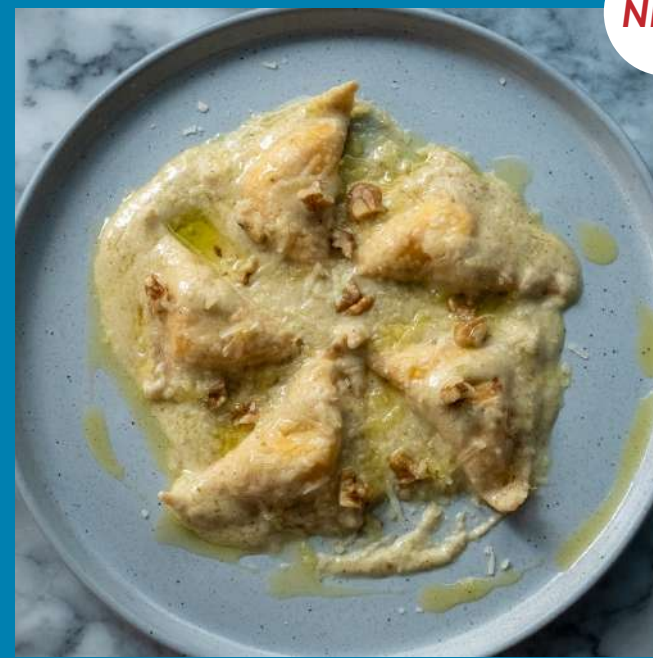
Pansotti con Salsa di Noci 390

* Price is subject to govt. tax * Delivery fee is excluded * Please allow our service team to reconfirm your order as some items might not be available