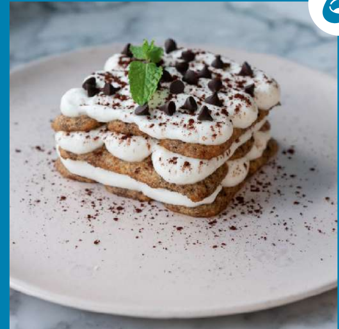
La Dotta's Tiramisu 340

* Price is subject to govt. tax * Delivery fee is excluded * Please allow our service team to reconfirm your order as some items might not be available