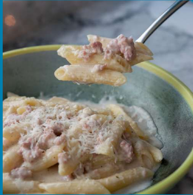
Pennette with pork sausage 290