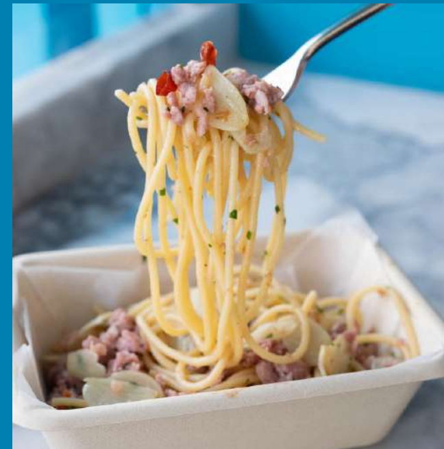
Spaghetti AOP with fresh sausage 290

* Price is subject to govt. tax * Delivery fee is excluded * Please allow our service team to reconfirm your order as some items might not be available