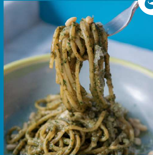
Pesto "alla Genovese" (Casarecce or Linguine) 390

* Price is subject to govt. tax * Delivery fee is excluded * Please allow our service team to reconfirm your order as some items might not be available