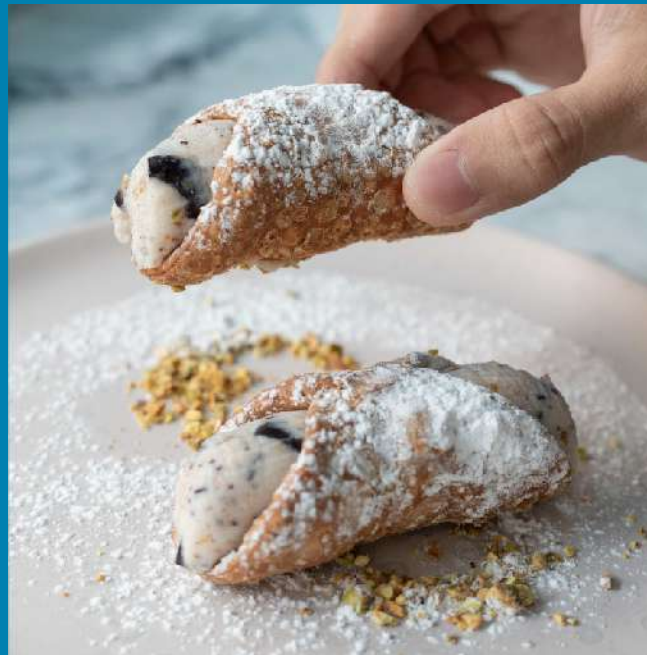
Sicilian Cannoli 290