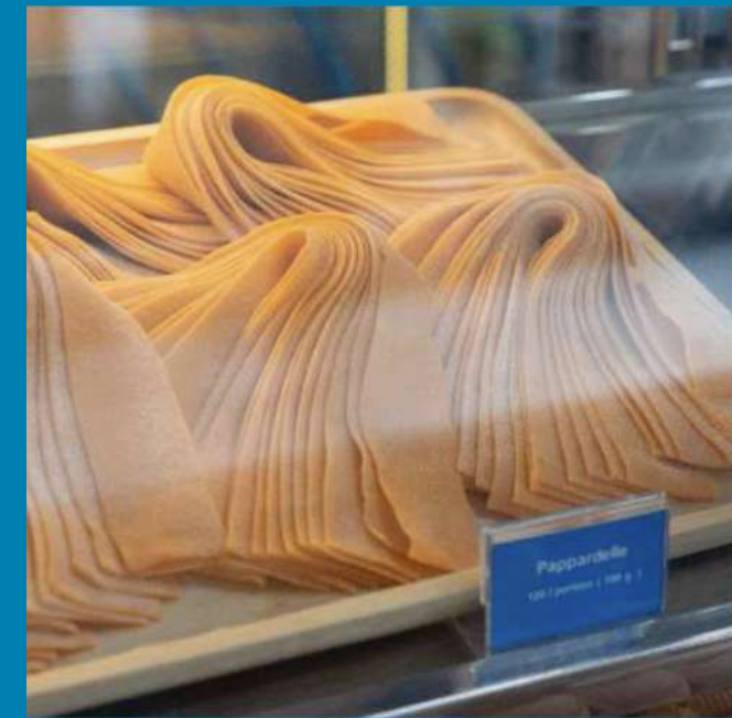
Pappardelle (fresh pasta - 100 g) 140