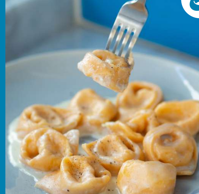
Tortelloni 4 cheese 390 Add Italian black truffle 1 gram (140)